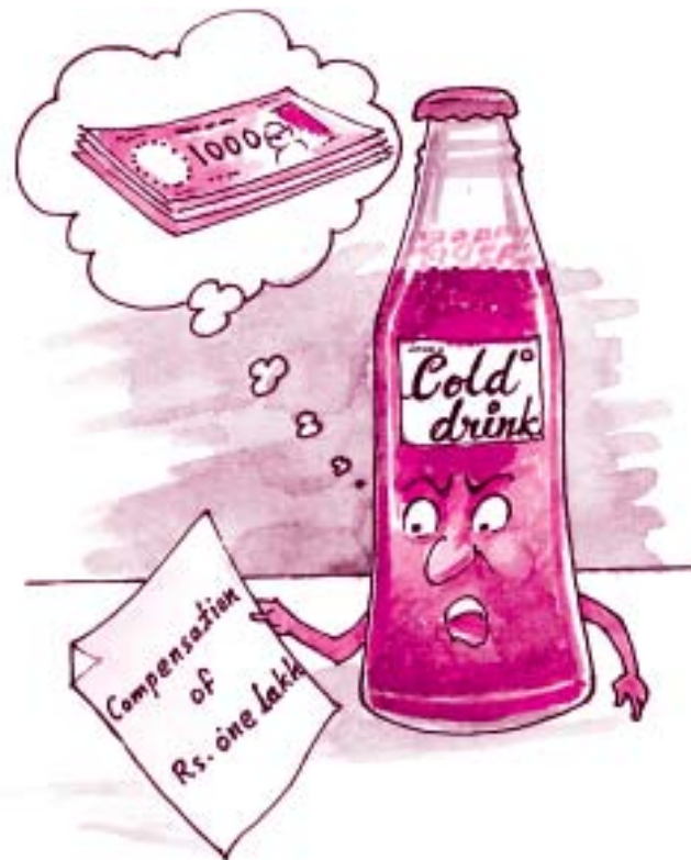
Compensation for impurities in cold drinks

themselves into consumer associations for protection and promotion of their interests. At the same time, consumer protection has a special significance for businesses too.