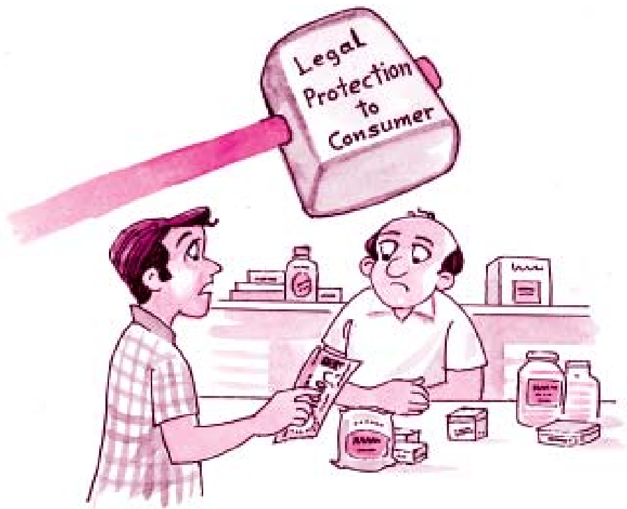
Protection against malpractices and exploitation

against defective goods, deficient services, unfair trade practices, and other forms of their exploitation. The Act provides for the setting up of a three-tier machinery, consisting of District Forums, State Commissions and the National Commission. It also provides for the formation of consumer protection councils in every District and State, and at the apex level.