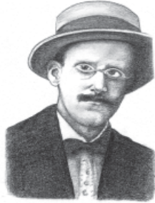
James Joyce 1882-1941

James Joyce is a major literary figure of the first quarter of the twentieth century. He is known for his bold experiments in narrative techniques in fiction, and Ulysses is his most famous work. 'Eveline' is one of the fifteen stories of Dublin life that form Dubliners, first published in 1914. It is a sympathetic portrayal of Eveline, who has within her reach escape from the drudgery of her life but cannot gather enough courage to seize it.