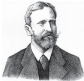
Joseph Conrad 1857-1924

Joseph Conrad, born of Polish parents in the Russian Ukraine, began a seafaring life in 1874. He learnt English at the age of 21, and in 1886 became a British citizen. His famous works include The Nigger of the Narcissus (1898), Lord Jim (1900) and Nostromo (1904). His greatest skill lies in his capacity to evoke an atmosphere through careful attention to detail. He uses the method of story within a story to convey his sense of the inexplicable inner character of life and the shifting quality of the mind. All Conrad's characters suffer from a sense of isolation.