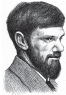
D.H. Lawrence 1885-1930

D.H. Lawrence was born in a coal-mining town. He was the son of an uneducated miner and an ambitious mother who was a teacher. His wife was German, and the couple lived, at various times, in Italy, Germany, Australia, Tahiti and Mexico. Lawrence's writings reflect a revolt against puritanism, mediocrity and the dehumanisation of an industrial society.