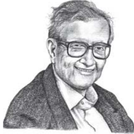
Amartya Sen Born 1933

Amartya Sen was awarded the Nobel Prize in Economics in 1998 for his contribution in the field of welfare economics. He is Lamont Professor at Harvard.