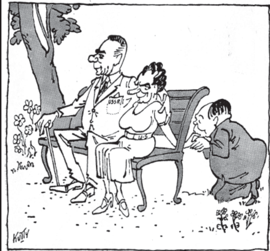
POLITICAL SPRING China makes overtures to the USA.

Drawn by well-known Indian cartoonist Kutty, these two cartoons depict an Indian view of the Cold War. The first cartoon was drawn when the US entered into a secret understanding with China, keeping the USSR in the dark. Find out more about the characters in the cartoon. The second cartoon depicts the American misadventure in Vietnam. Find out more about the Vietnam War.