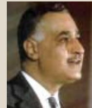
Gamal Abdel Nasser (1918-70) Ruled Egypt from 1952 to 1970; espoused the causes of Arab nationalism, socialism and anti-imperialism; nationalised the Suez Canal, leading to an international conflict in 1956.