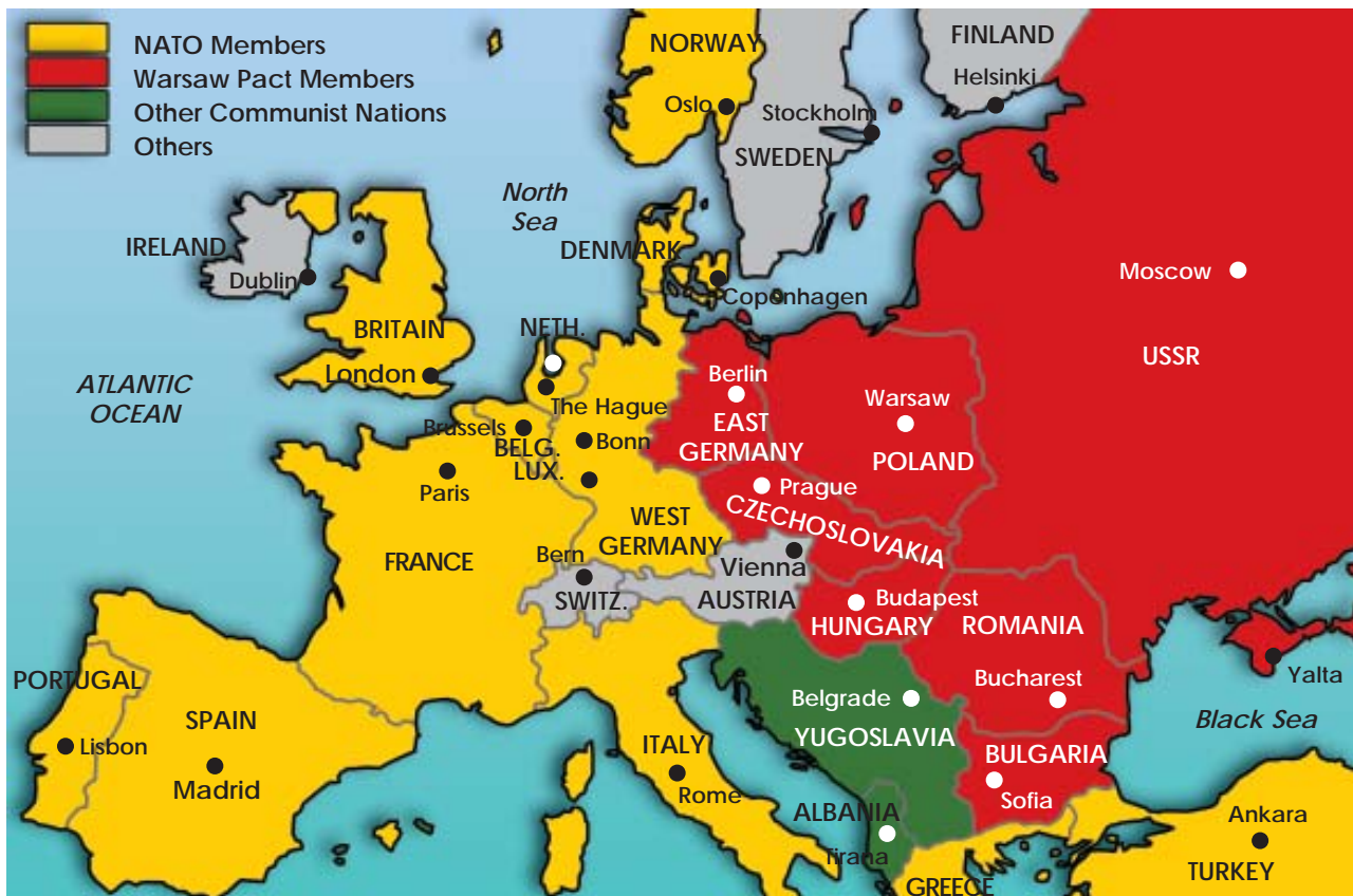
Map showing the way Europe was divided into rival alliances during the Cold War

3. By comparing this map with that of the European Union map, identify three new countries that came up in the post-Cold War period.