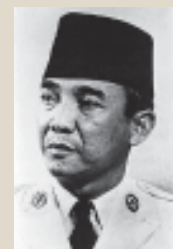
Sukarno (1901-70) First President of Indonesia (1945-65); led the freedom struggle; espoused the causes of socialism and anti-imperialism; organised the Bandung Conference; overthrown in a military coup.